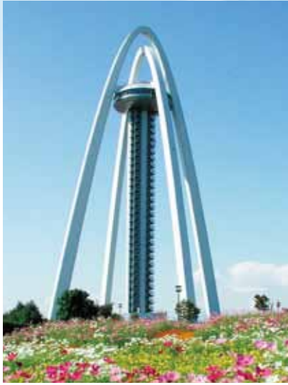
Twin Arch 138