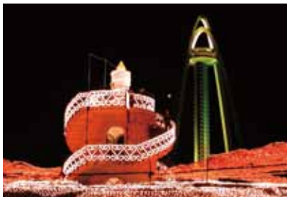
Twin Arch Christmas celebrations