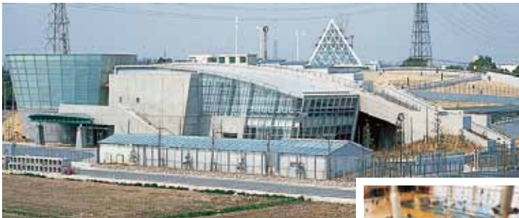
Swimming pool heated ▶

This plaza is a popular place where Ichinomiya residents enjoy recreation and relaxation and also learning. Within the lush, abundant environment of the plaza, which incorporates a natural forest, the "Yuurin Hall" has a research room and music room, an 18-diameter Planetarium, and also offers field athletics and a family pool. (Tokinoshima)