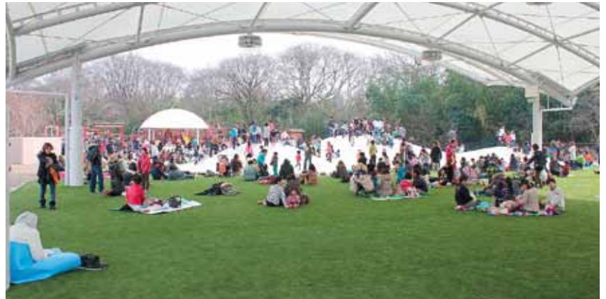
Tsudoi no Hiroba

In the Kiso Sansen National Government Park, opened in April, 1995, there are many facilities and attractions, such as the “Rose Stream”, which is a large rose garden, and “Tsudoi no Hiroba”, which is an area for people to interact and has a big roof and climbing wall. A large variety of trees and flowers are planted. Many people visit during various seasonal events that include the “Cherry Blossom Festival”, “Spring Festival”, “Summer Festival”, and the “Autumn Festival”. “Twin Arch 138” consists of two arches, whose height is 138 meters. From the Observation Deck, at a height of 100 meters, one can enjoy a panoramic view of the extensive Nobi Plain, the Kiso River, and the mountains of the Japan Alps. (Komyoji)